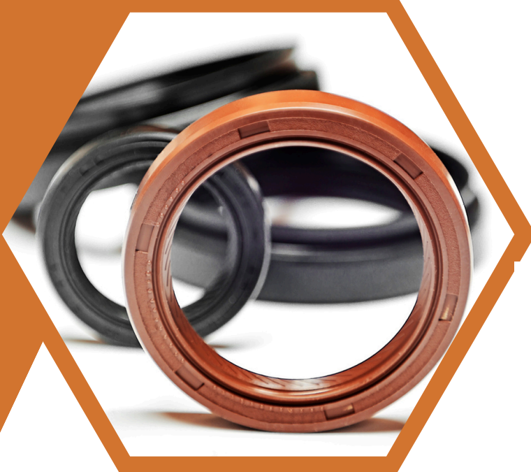
F100B Piston Seal